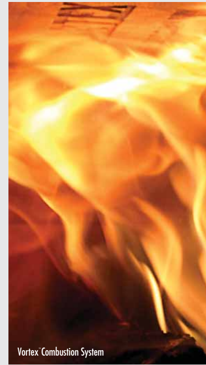
Vortex® Combustion System