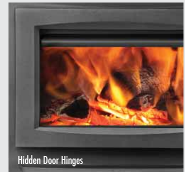
Hidden Door Hinges