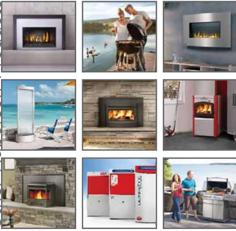
Fireplace Inserts • Charcoal Grills • Gas Fireplaces • Waterfalls • Wood Inserts Hybrid Furnaces • Pellet Insert • Heating & Cooling • Gourmet Grills