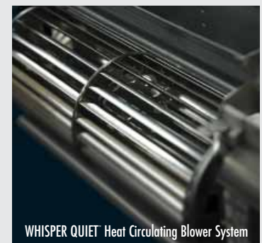
WHISPER QUIET® Heat Circulating Blower System